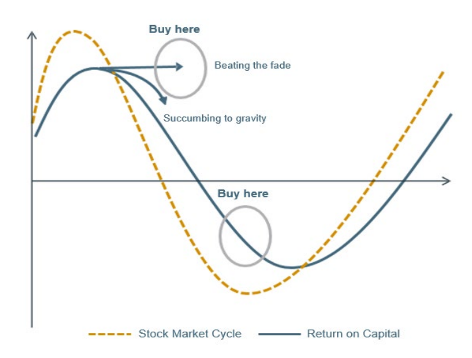
Chart 1: The Capital Cycle

sooner than in fact they do. Secondly, where the market underestimates the likelihood of returns recovering in beaten up industries, when the supply side is already improving.